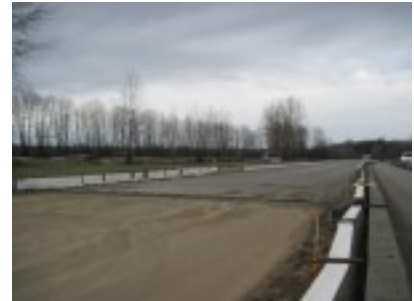
Looking down the main straight March 1 2014

The following is taken from a February 27th email notification from the SCCBC Executive to their Club members explaining the situation: