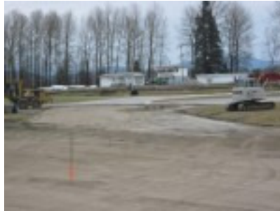
Turn 9 March 1 2014