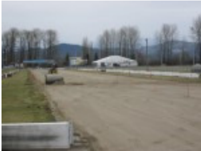
Looking towards drag strip start line March 1 2014

The major change is that the first race event originally scheduled for the March 29th/30th weekend has been cancelled and the final event of the season on October 11th/12th has now been changed to a 'regular' CACC weekend. These changes are required because of ongoing paving projects at Mission Raceway.