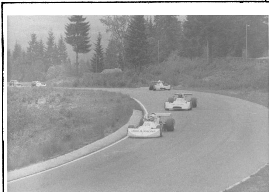
COMING OUT OF THE ESSESS

Once again, the Player's Pacific was on? To make the Challenge Series more challenging, the track was given a special treatment of oil and water. Unfortunately, oil and water don't mix, neither do race cars, virtually every car was off the track at one time or another. It was an interesting race from start to finish.