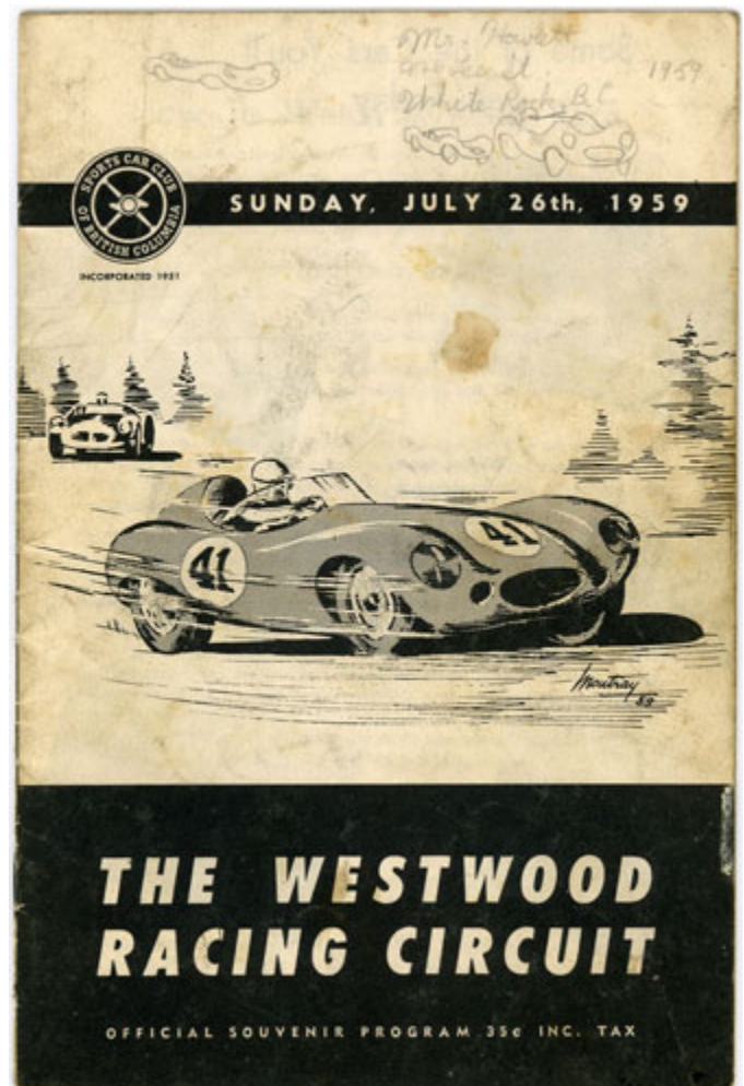
July 26 1959 - Opening day program (SCCBC Archives) (From Westwood50 website )

(From http://en.wikipedia.org/wiki/Westwood_Motorsport_Park which references Tom Johnston, Westwood, Everyone's Favourite Racing Circuit , Granville Island Publishing)